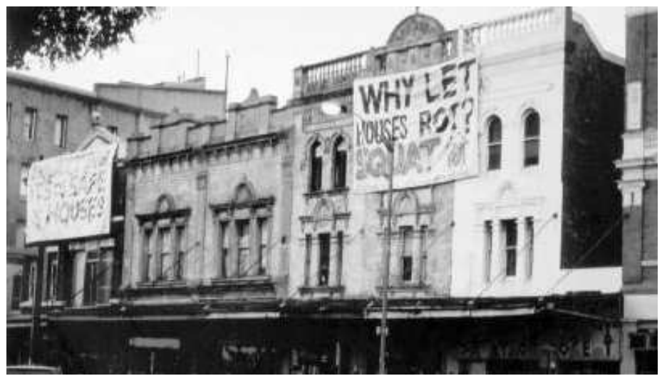
Squatted social centre Sydney

The Newcastle squat organisers cleared out an old locksmith shop and launched a dynamic art and event space in December 2000. The space played host to political film screenings, free dinners, durational performances, experimental sound nights, site-specific installations and acted as a hub for political & community activity. Squatted social centres spread throughout Newcastle. The larger Broadway Squat hosted numerous festivals and held mass community support - and even led to the creation of an 'UnRealestate' for other Squatters!